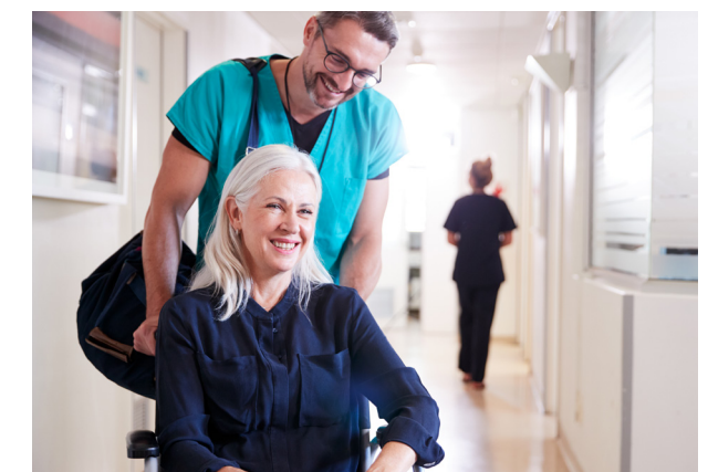
Better data supports enhanced recovery and rapid discharge.