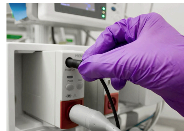
The Argos simply connects to the analog output of the blood pressure signal from a compatible multi-parameter monitor.